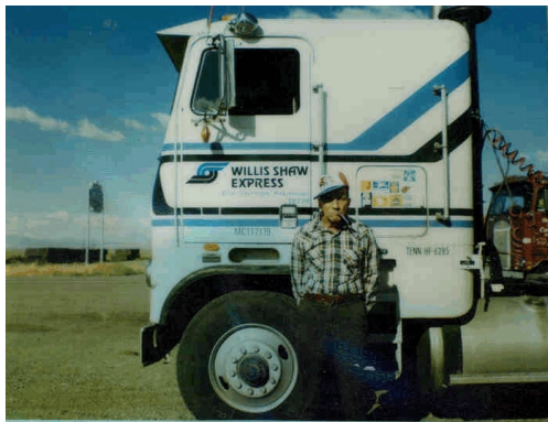
The Ole Goat

Yes there were times, I'm sure you knew, When I bit off more than I could chew, But thru it all, when there was doubt, I ate it up, and spit it out. I faced it all, and I stood tall, And did it my way.